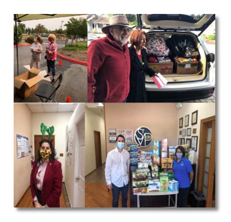
SVDP Contra Costa County Christmas Elves at Work

How wonderful it was to find out that we are becoming friends with our fellow Vincentians!