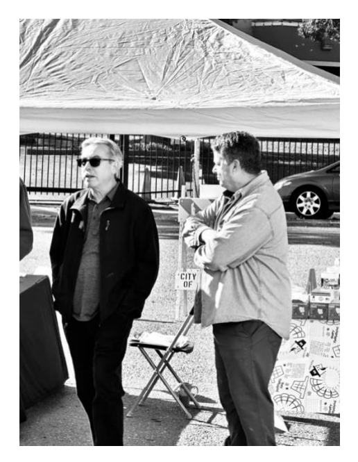
St. Vincent de Paul with the help of our Friends, Conferences, Neighbors and Loaves and Fishes Re-Opened the Free Dining Room to Celebrate Thanksgiving together.